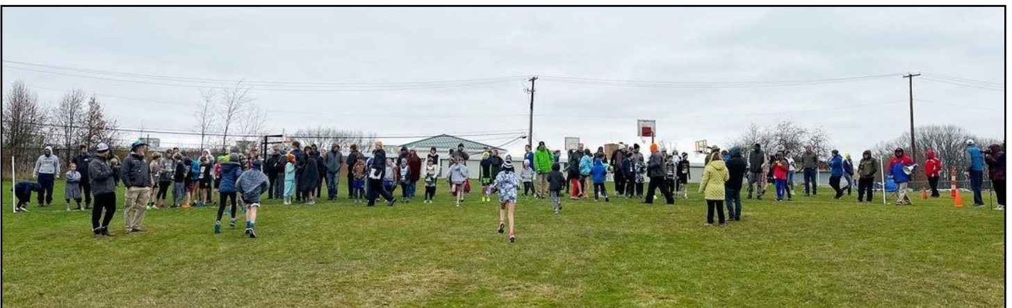
Runners line up at the start at Columbiana High School.

Saturday, December 14 , is the USATF Club Cross Country Meet in Tacoma, WA . This is an Open and Masters event that has become a very popular event for teams.